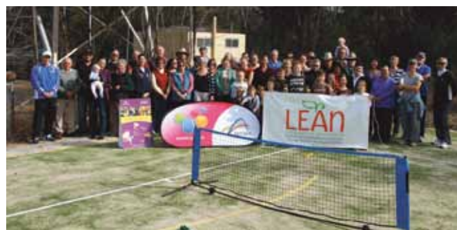
(Above) Capertree Valley Community Tennis Day – just one of the achievements of the LEAN project over the past 12 months.