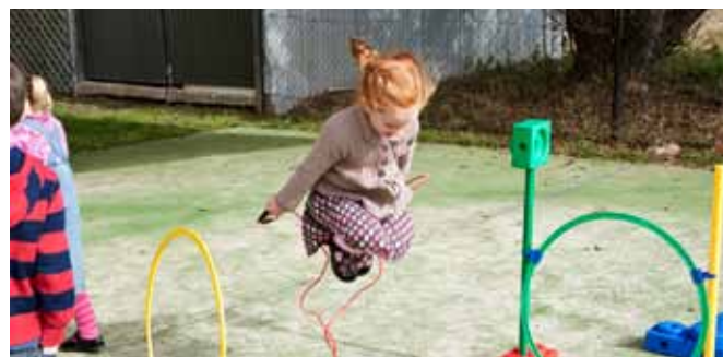
(Below) The LEAN program aims to encourage good nutrition and healthy physical activity in local communities.