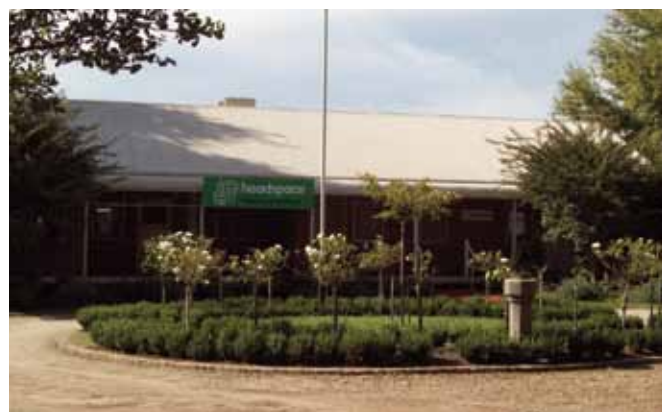
NSW Central West headspace is the first headspace centre in NSW to attain accreditation by the Australian General Practice Accreditation Limited, recognizing the high standards and quality service provided to local young people.

Another significant outcome of the project is the collaborative relationships that have been formed between Western Local Health Network Mental Health, Drug and Alcohol and Health Promotion and Prevention units; local NGO's and GP practices. Through the establishment of a reference group, issues around referral pathways, professional development and case conferencing have been identified and steps taken to address these.